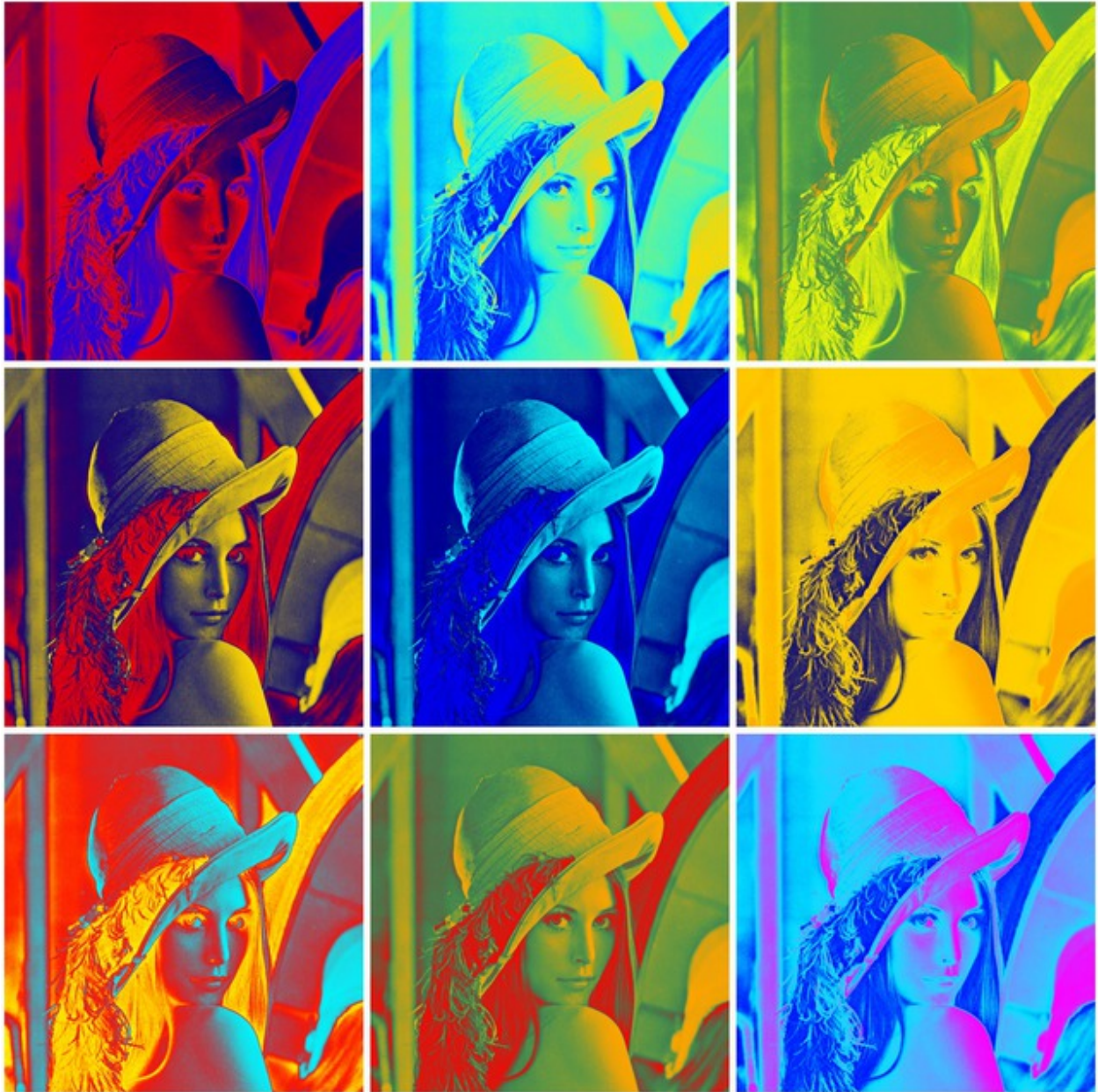
Fig. 2: Warholized version of Lena