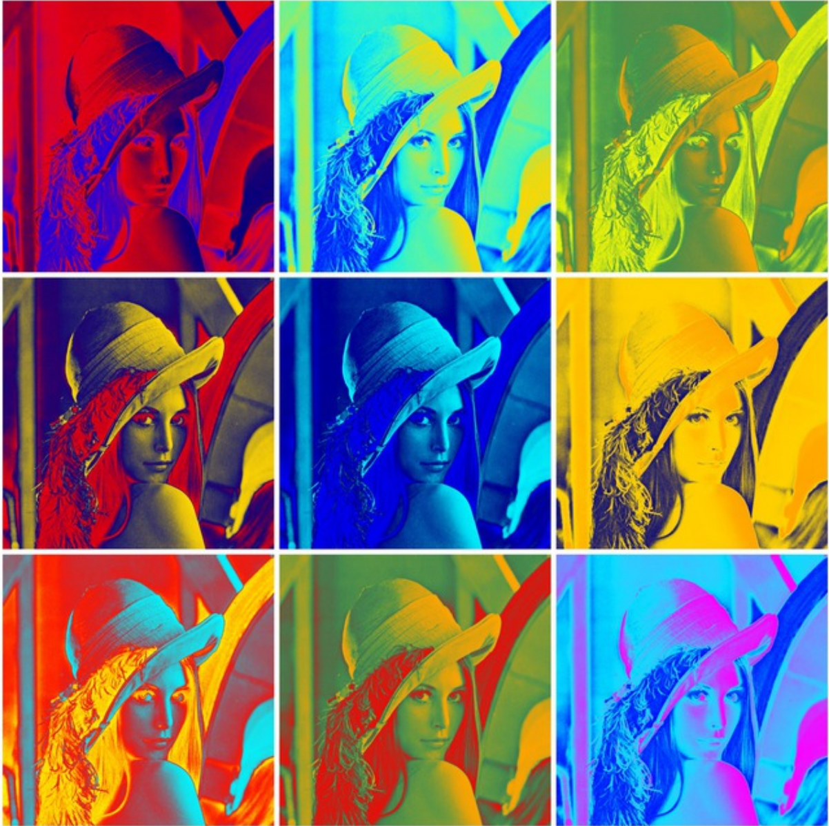
Fig. 2.2: Warholized version of Lena